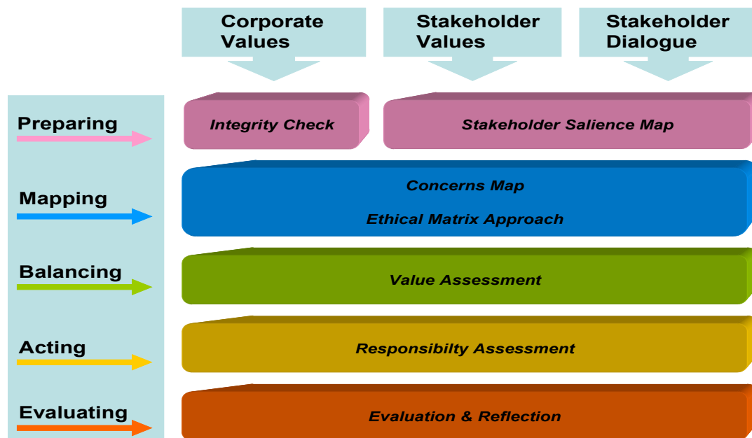
Box 2.10 An overview of the CoMoRe-kit

assigned and taken up. The CoMoRe-kit consists of seven different ethical tools (see Box 2.11).